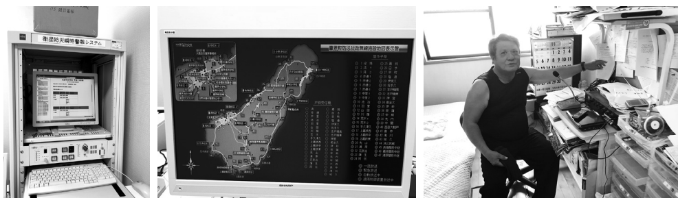
Figure 8 and 9 (left and center): Kikaijima Municipal BM technology 2017

Death announcements, aired at the request of the deceased family, are another important local information function. Although Bōsai Musen is mostly used for providing public information, private information, such as funerals, is also aired at the request of the deceased's family. In such small island communities, a funeral is considered a public matter. Even if there is no request from the deceased's family, the community head will still air the funeral information as a matter of public concern. Information, thus, on who has died and how, when and where and the time of the funeral service will be broadcasted as a community matter, even if there is no request from the deceased's family.