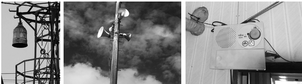
Figure 1 (left): Bōsai Musen 's predecessor

Bōsai is a Japanese word used to express various efforts to mitigate disaster risk ( bō 防 protection, sai 災 risk), while Musen (無線) refers to wireless radio. Operating at municipal and village levels, Bōsai Musen , also commonly referred to as goji no chaimu (5時のチャイム the 5pm bell), Japan's local government disaster administration wireless broadcast system, can be found in all Japanese islands (INAGAKI 2017, GOMI 2014, AIZAWA 2009, GOTO and MITSUO 2009).