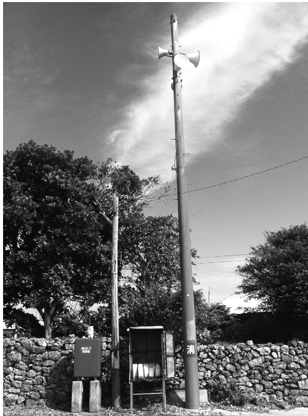
Figure 7: Kikaijima BM loudspeaker 2017

Two or three employees of the General Affairs Division are usually in charge of BM who prerecord information around 5 pm every day and air it at 6.30 pm and 6:30 am the following morning. The content changes every day, but it mostly involves that day’s events. On special occasions such as in typhoon season, the information on disaster prevention is