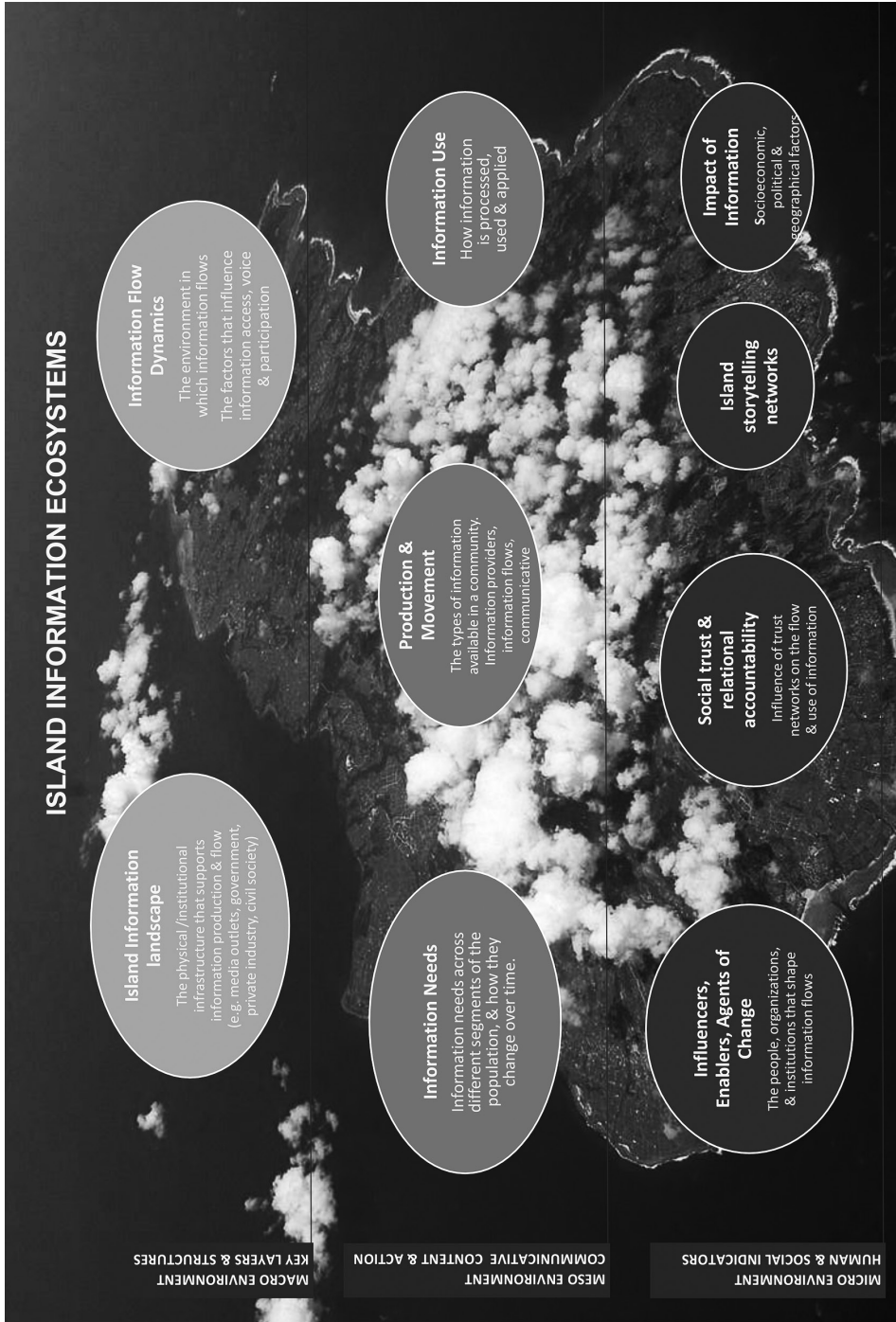
Figure 6: Island information ecosystem mapping guide